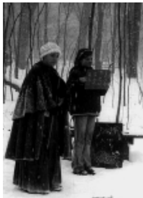
Camp Kern's outdoor education program

* ($3,607)-purchases an automated external defibrillator for the high school in order to aid anyone with sudden cardiac arrest prior to the arrival of paramedics.