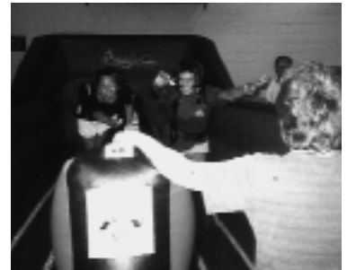
Parents Who Care sponsor the after-prom party annually

* Sunrise Center for Adults, Inc.-($3,000)-aids in the purchase of a wheelchair lift in this adult day center's van.