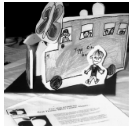
Elementary art students created original works, which were used as centerpieces at the Tippecanoe Educational Endowment kickoff breakfast in January 2000.