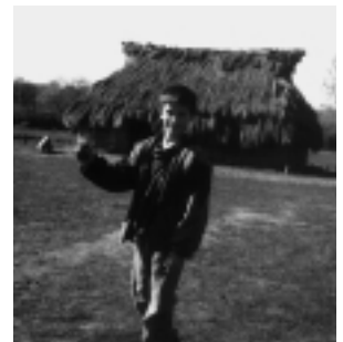
SunWatch Indian Village

* ($978.75)-transports students to the days of slavery in the 1800s as they experience a ride on the Underground Railroad through Freedom Train, the Victoria Theatre musical production of the life of Harriet Tubman. L.T. Ball Junior High School students will be taking this ride in March 2000.